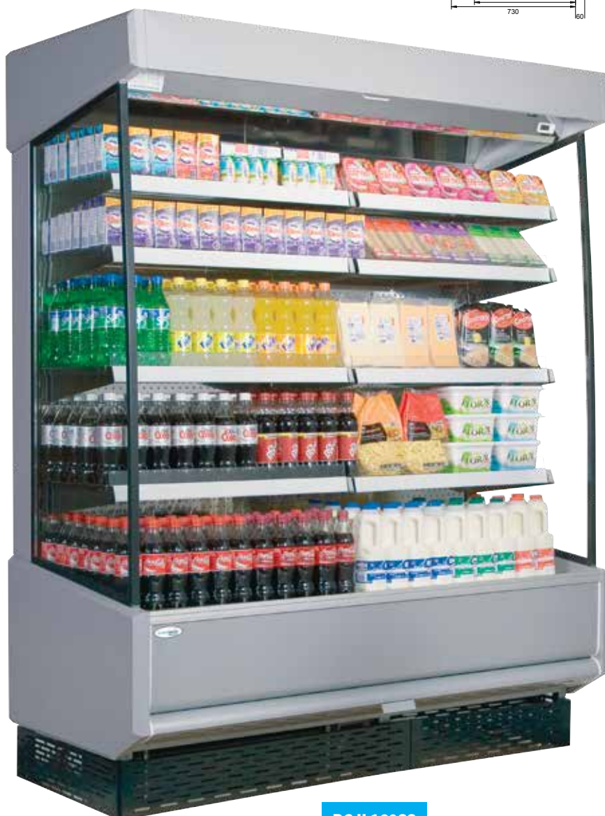
RC II 160SS